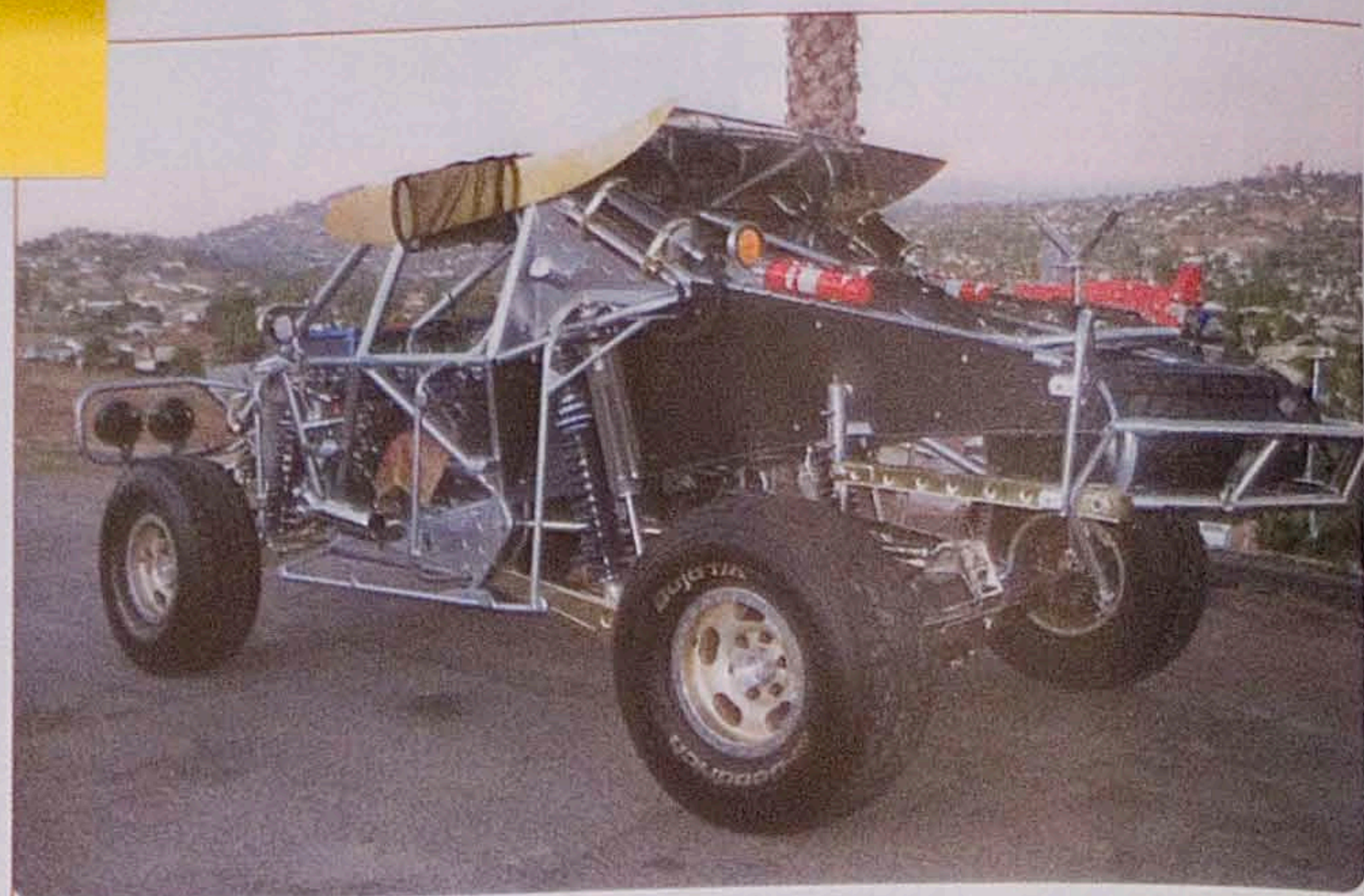
BIG OLY TROPHY TRUCK NEARING COMPLETION